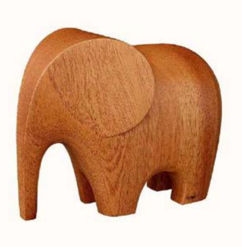
Appu the Elephant