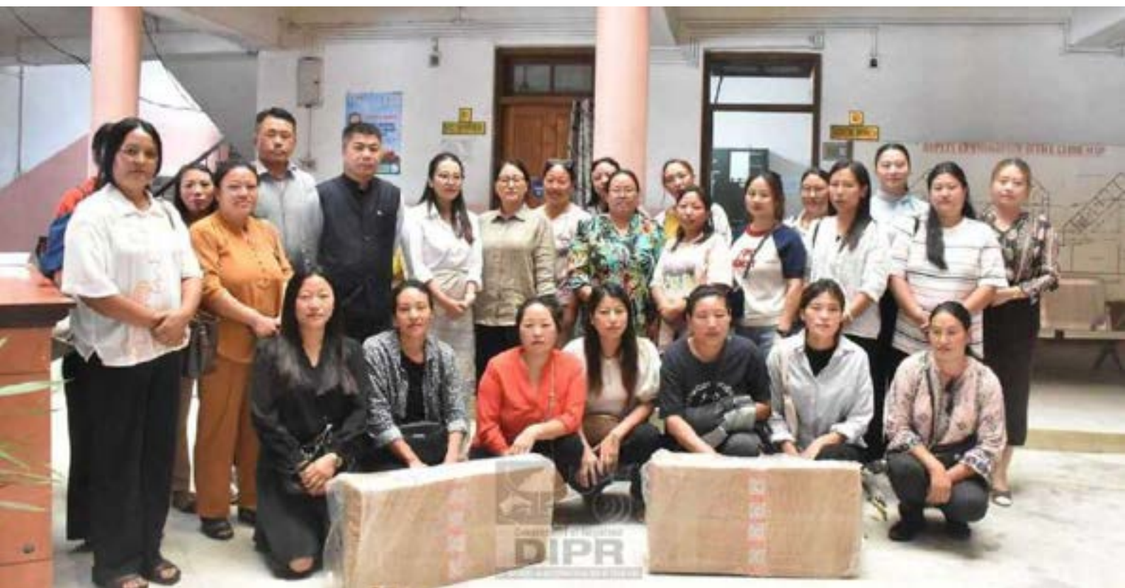
PM Vishwakarma Doll & Toy trained artisans from Kohima District receiving toolkits from the Deputy Commissioner.

Pictures credit: Department of Information and Public Relations, Government of Nagaland