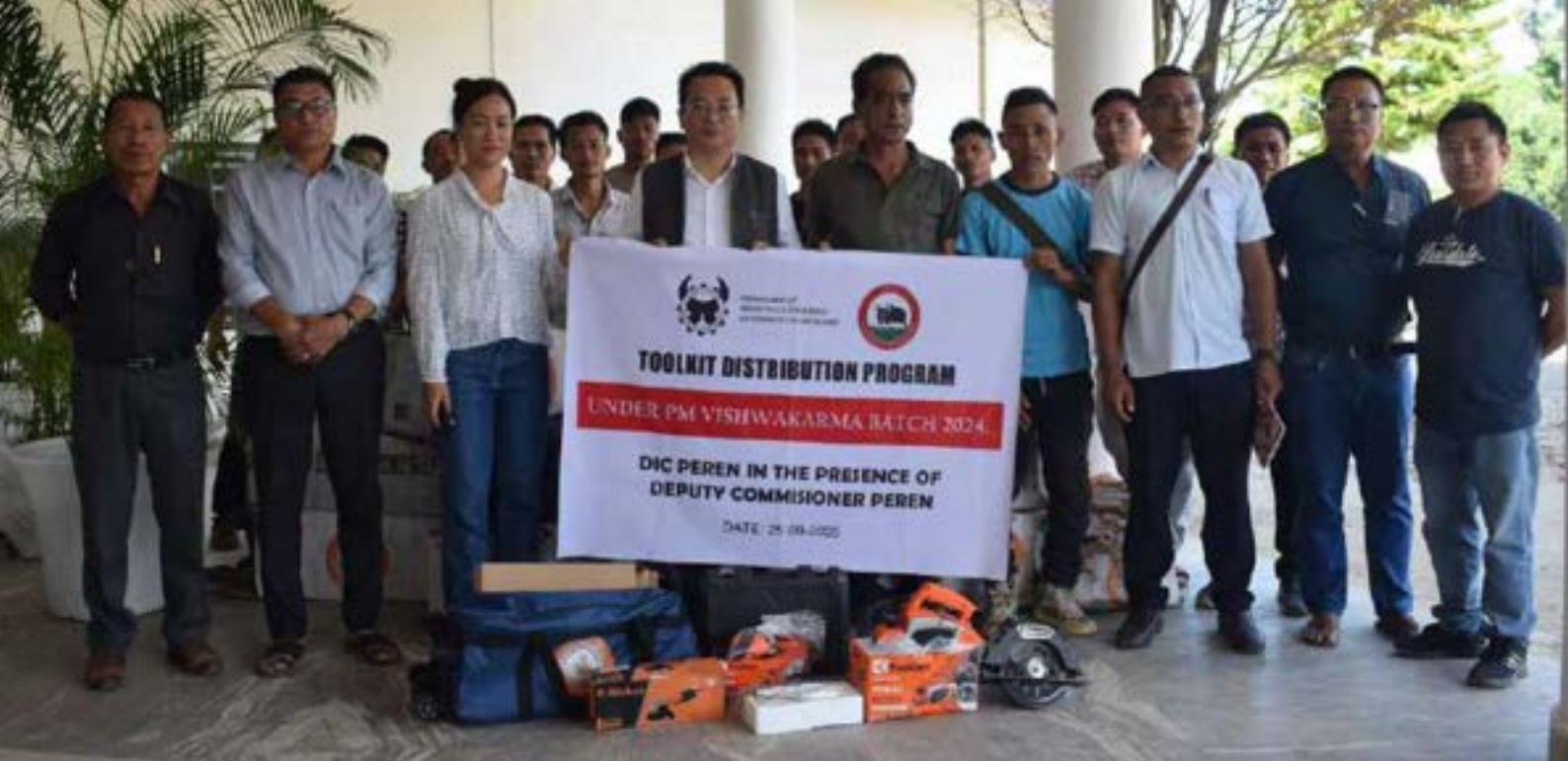
PM Vishwakarma Carpentry trained artisans from Peren District receiving toolkits from the Deputy Commissioner.