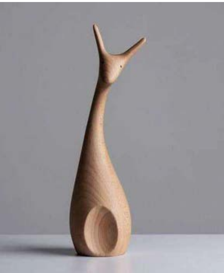
Joey the Kangaroo