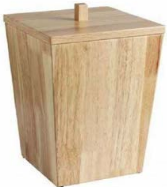
WOODEN DUSTBIN WITH LID