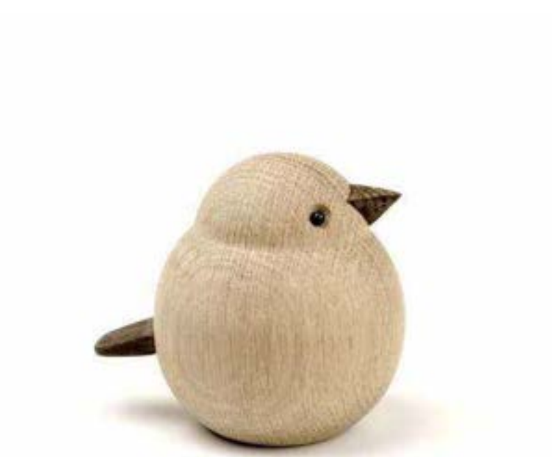
Blob the Birdie